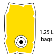
1.25 L bags